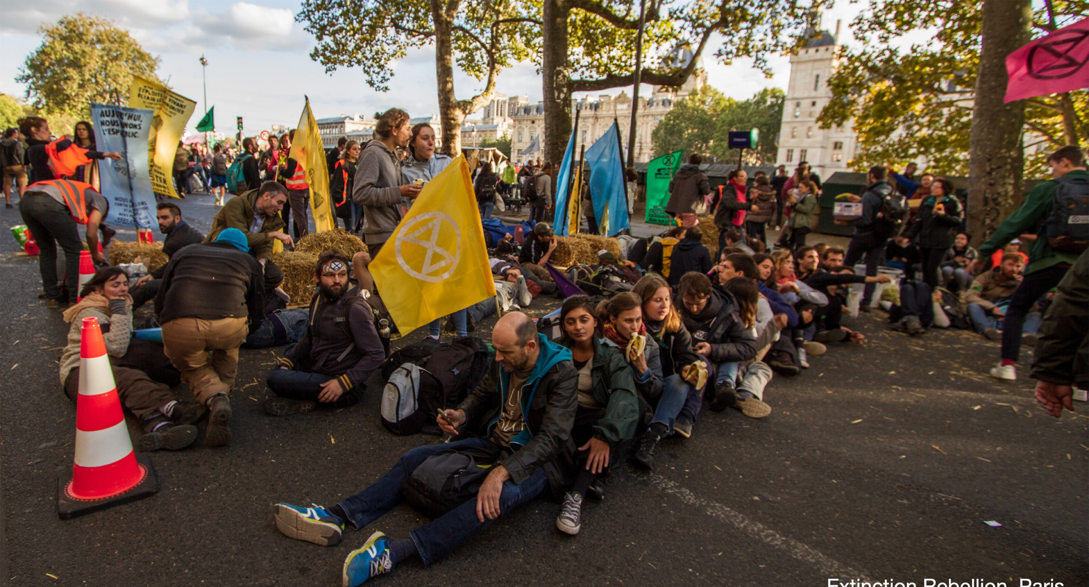
Extinction Rebellion, Paris